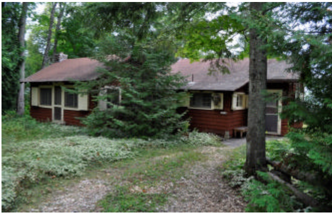
Charming, Cozy, Cedar Cabin Magnificent View of Lake Michigan Sunrise

“Same Time Next Year” on Lakeshore Road 6048 Lakeshore Rd Jacksonport, Wisconsin